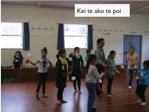
Kei te ako te poi