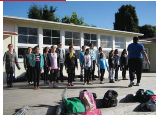
Ngā kotiro o te kapa