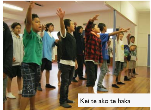
Kei te ako te haka